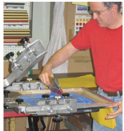
Ink is squeezed through the blocked screen onto the canvas

A blocked printing screen with the Read to Me! logo is then placed on top of the canvas. The screen is covered with royal blue ink (for an English bag) or bright red ink (for the French bag) which is then squeezed through the screen. The canvas is left with a perfect imprint of the bear logo. Each