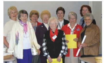
Volunteers at Valley Regional Health Care Centre