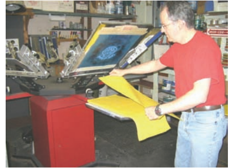
At Maritime Campus, the canvas is placed on the textile printing press

of yellow canvas is placed on a textile printing press.